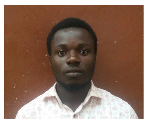
never will they regret training us."