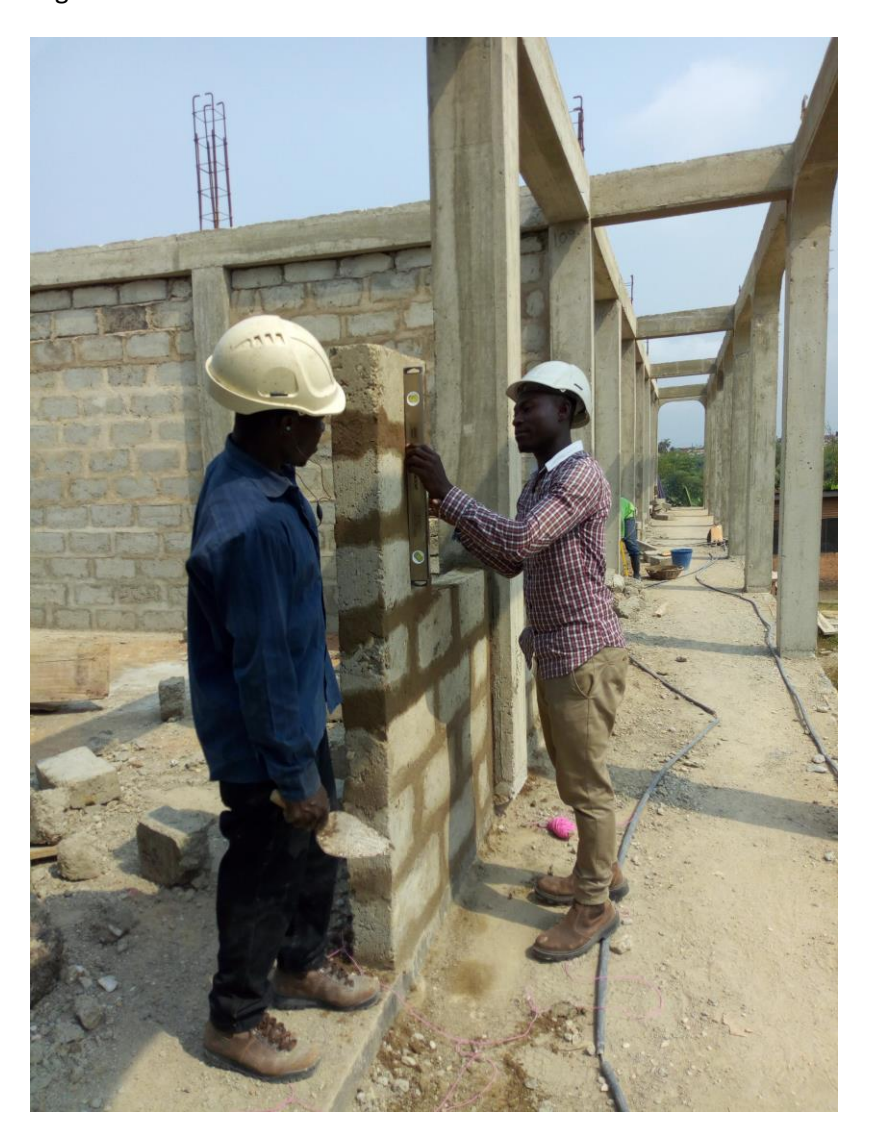
Inspection of masonry work during on the job training inspection

The maiden group of GSLEP trainees have excelled and proven the value of the enhanced concept having successfully constructed a first floor, 8 unit classroom block extension for the Prestea Senior High Technical School!